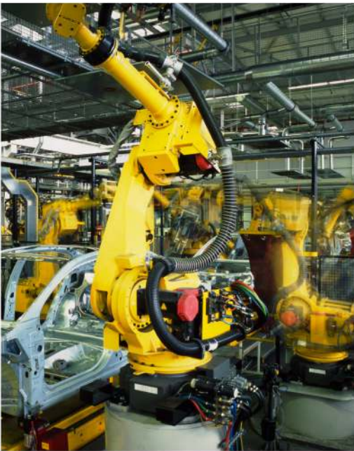
Figure 2 Krytox™ Performance Lubricants Product Range

Krytox™ lubricants provide OEMs with significant cost savings when specified for use during the design phase. By lengthening the life of critical components, Krytox™ lubricants reduce repair costs and potentially save millions in warranty claims.